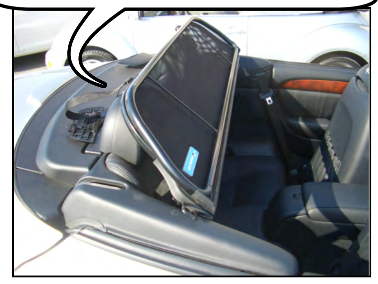
Once attached the black snap hooks will face towards the back of the car. Pull each snap hook up to lock it in place.

Next, place the wind deflector so it sits on the rear head rests as shown below. Making sure that the black snap hook straps are behind the back seat head rests.